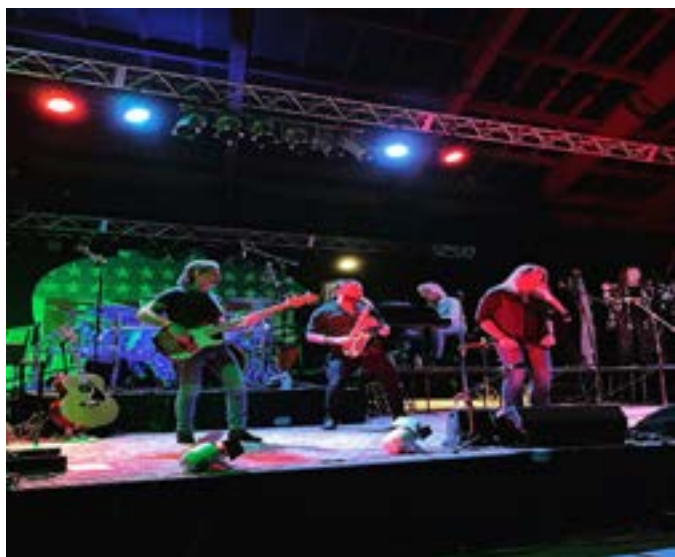
Hollywood Nights - Bob Seger Experience Aug. 11 at NARA

MORE WINTER PROGRAMS COMING SOON INCLUDING: CRAFTY KIDS, CARDS & COFFEE KIDS INDOOR SPORTS