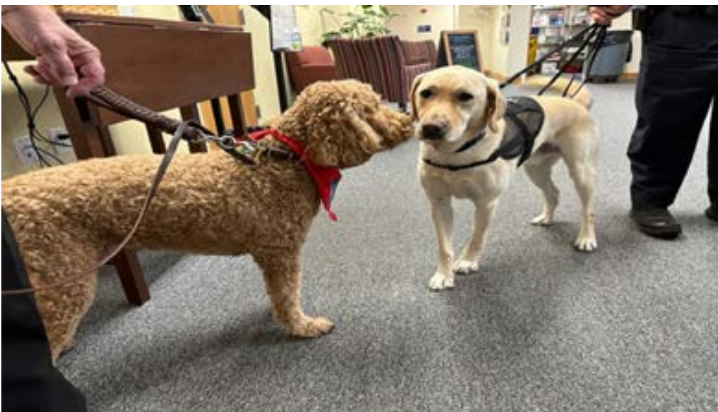
Photo Bodacious the therapy dog and Zane the APD comfort dog brighten people's day at the Senior Center

Newsletter: Did you know that you can subscribe to the monthly newsletter online? Family members are encouraged to see what we offer and may be of interest to their older family members. It just takes a moment at: https://actoncoa.com/list.aspx