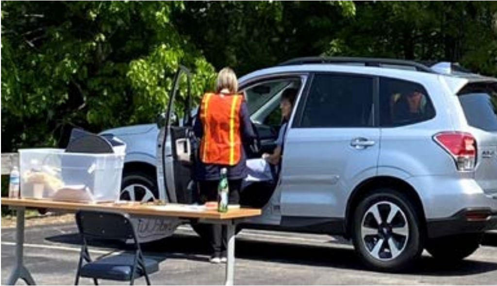
Photo The CarFit event at the Senior Center is a great opportunity to make adjustments so your car fits you safely.