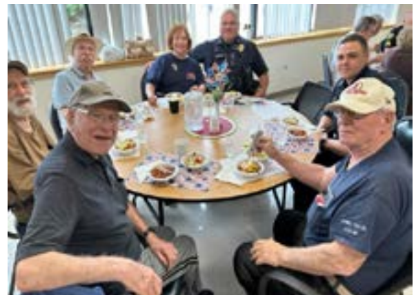
Photo: A full house at the Sr. Center for last month's First Responder Appreciation Lunch