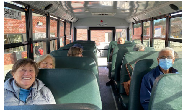
Seniors boarded a school bus to go "back to school" - they visited ABRHS for a tour, presentation and lunch.