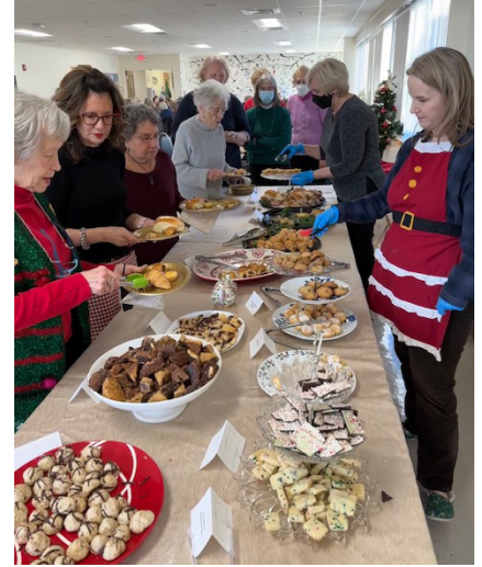
The annual holiday tea was a great success!

More information is available in the Winter Maintenance publication that can be found on the Town of Acton website.