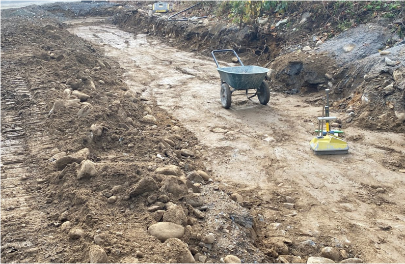
Compaction test for geothermal loops