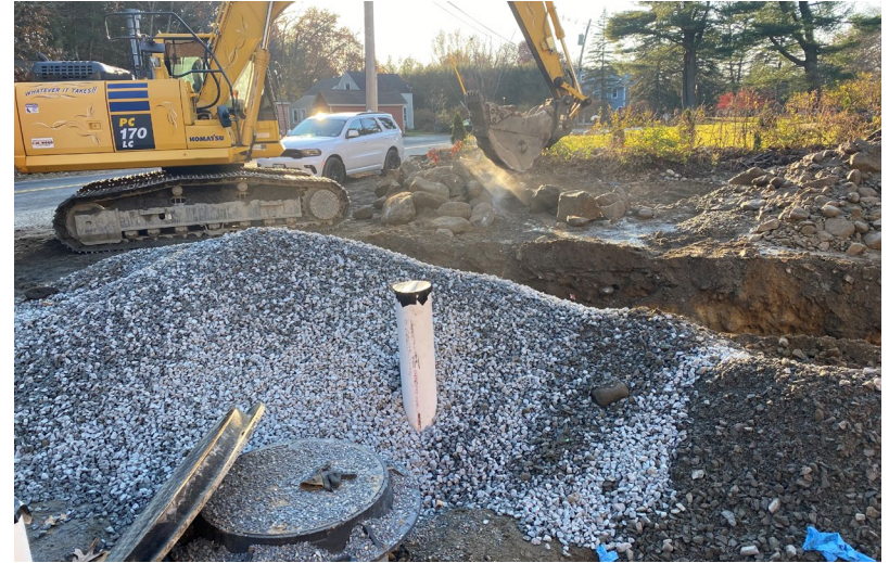
Geothermal loops excavation