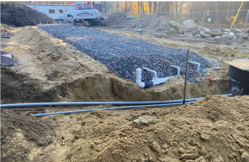
Leach field work