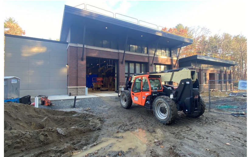
Overview of building from southwest