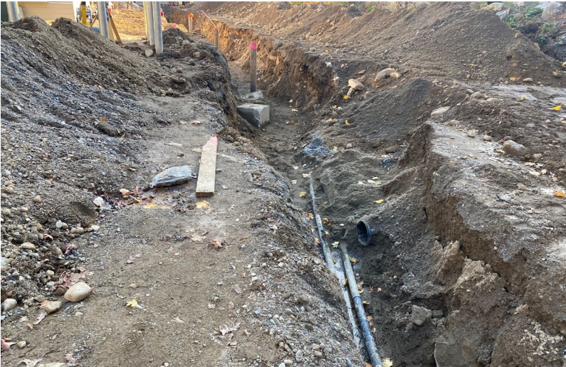
Geothermal loops excavation