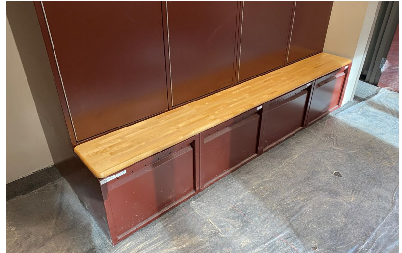
Bench cover installation