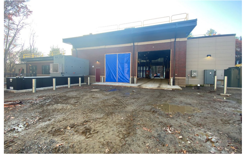
Overview of building from northwest