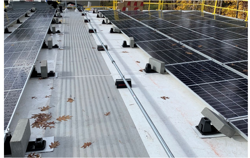
Solar system installation