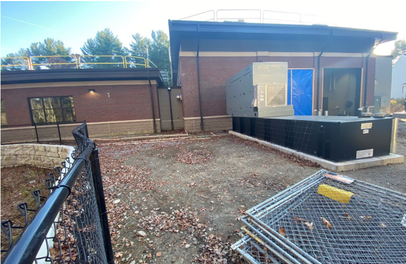
Overview of building from northeast