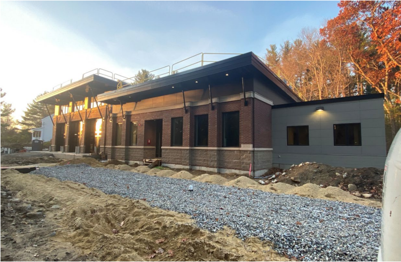
Overview of building from southeast