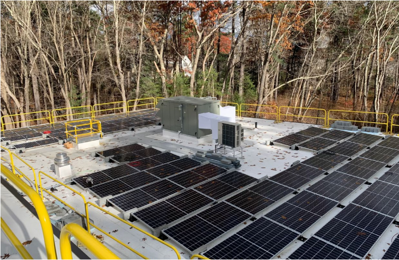
Solar system installation